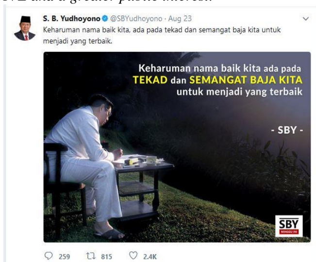
Figure 3. SBY's August 23 Post on His Reading Habit and Advice on Hard Work The Production of Text and Interpretation of Politicians' Social Media Posts

as "One of the attitudes of GREAT SOUL is the willingness to refrain oneself for a BIGGER OBJECTIVE and a greater public interest."