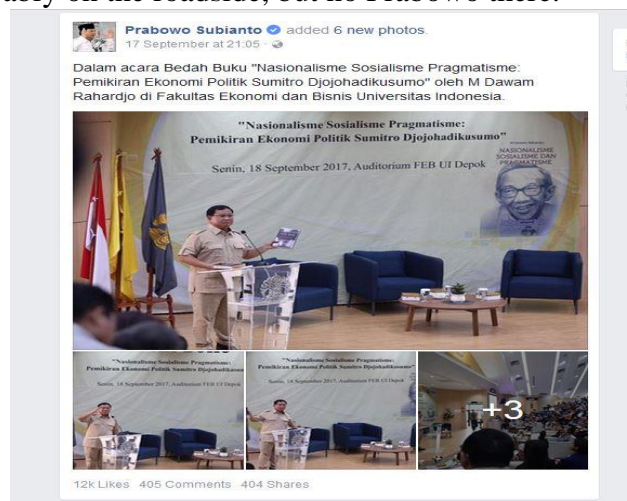
Figure 1. Prabowo's September 17 post on His Presence in Book Review about His Father (Soemitro Djojohadikusumo)

The photographs also display Prabowo's activities in various organizations for example as party chairman, member of the military, and chairman of the Association of Pencak Silat Indonesia. In many of these photos, he is seen talking in public, crowd, or shaking hands with one of the people surrounding him. In the photo of the Pencak Silat match opening at SEA GAMES 2017, Prabowo is seen holding a picture placard with someone in a red-and-white jacket, most likely the head of the Indonesian delegation or the coach. There is also a photo with the description 'Participating in Humanitarian Action to Stop Persecution of the Rohingyas' which shows a group of people gathered near two cars, probably on the roadside, but no Prabowo there.